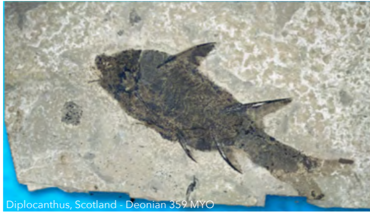
Diplocanthus , Scotland - Deonian 359 MYO