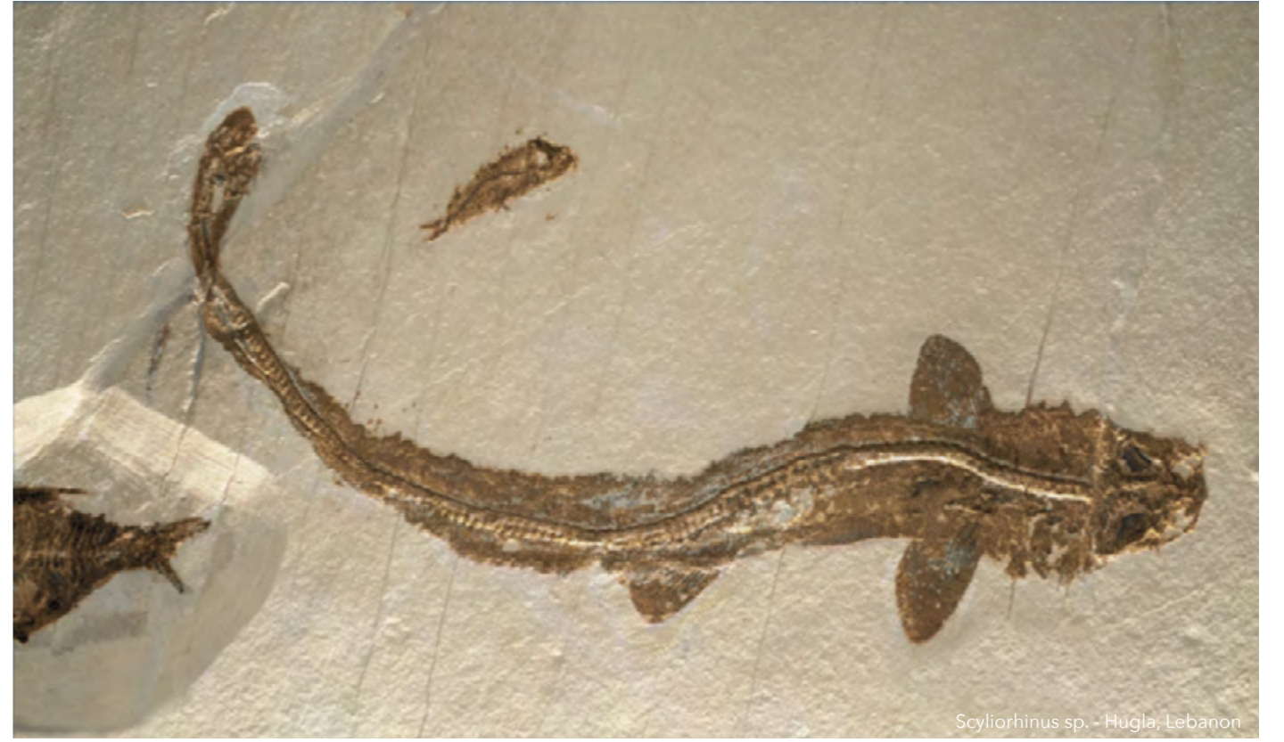
Scyliorhinus sp. - Hugla, Lebanon