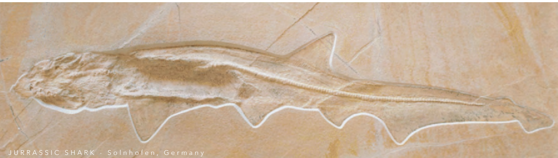
JURASSIC SHARK - Solnhofen, Germany