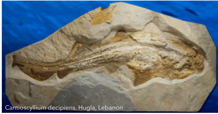
Cantioscyllium decipiens . Hugla, Lebanon