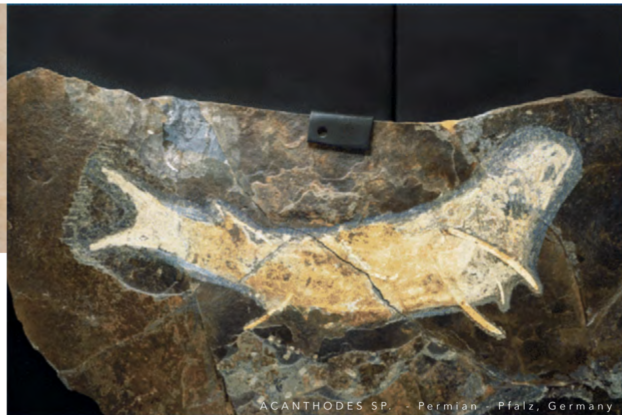
ACANTHODES SP. - Permian - Pfalz, Germany

Interested museums can compose a special exhibition on the basis of this unique collection, provided with detailed descriptions in digital or hard copy.