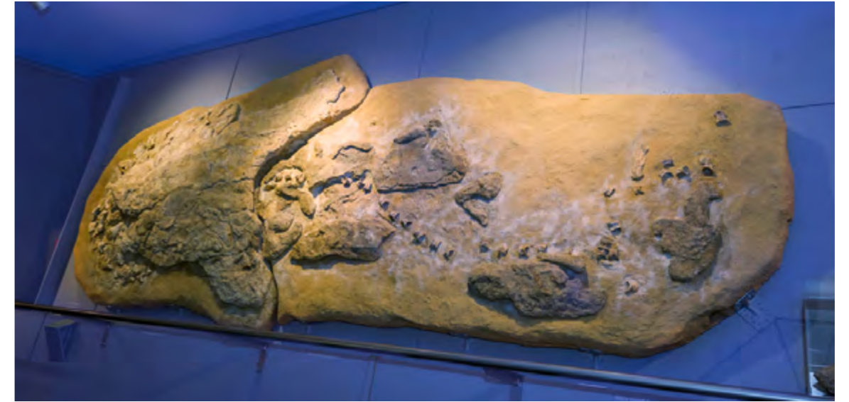
The Shark Exhibition currently on view in the Sauriermuseum of Aathal, Switzerland.