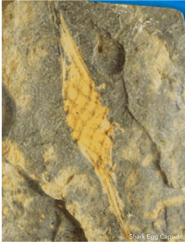
Shark Egg Capsule